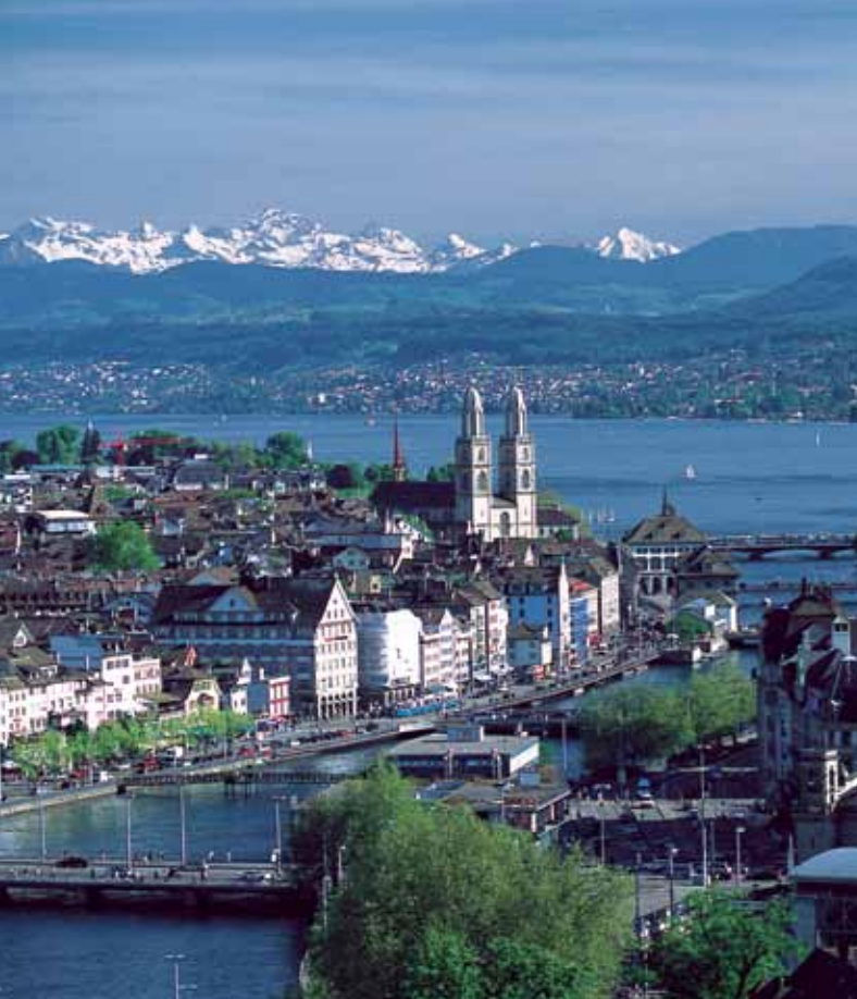
Zurich's well preserved Old Town with its Charlemagne Tower and the Fraumünster Church. Lake and River Limmat.